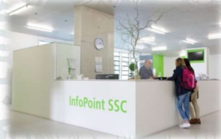
Student Service Center