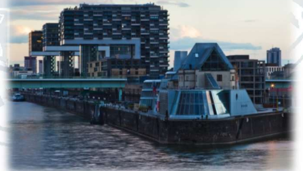
Chocolate Museum and Crane Houses