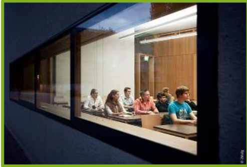
Accounting & Taxation