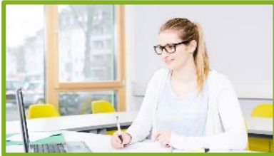
5 Programmes in Business Administration