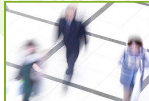
Demography and Social Inequality