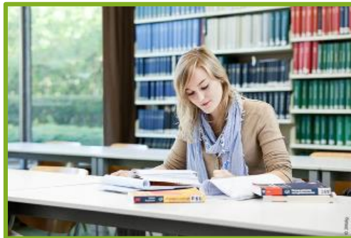
Health Economics and Management