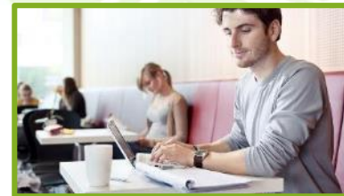
Sociology & Social Research