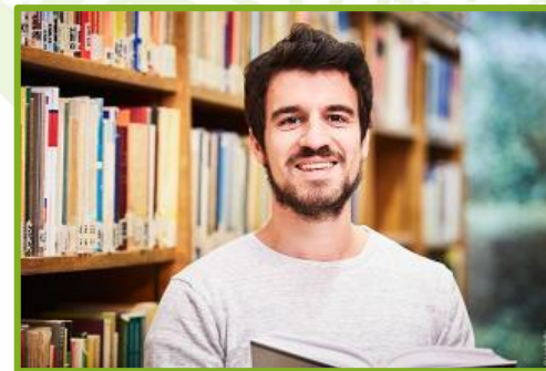
Supply Chain Management