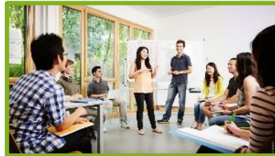
International Management (CEMS MIM)