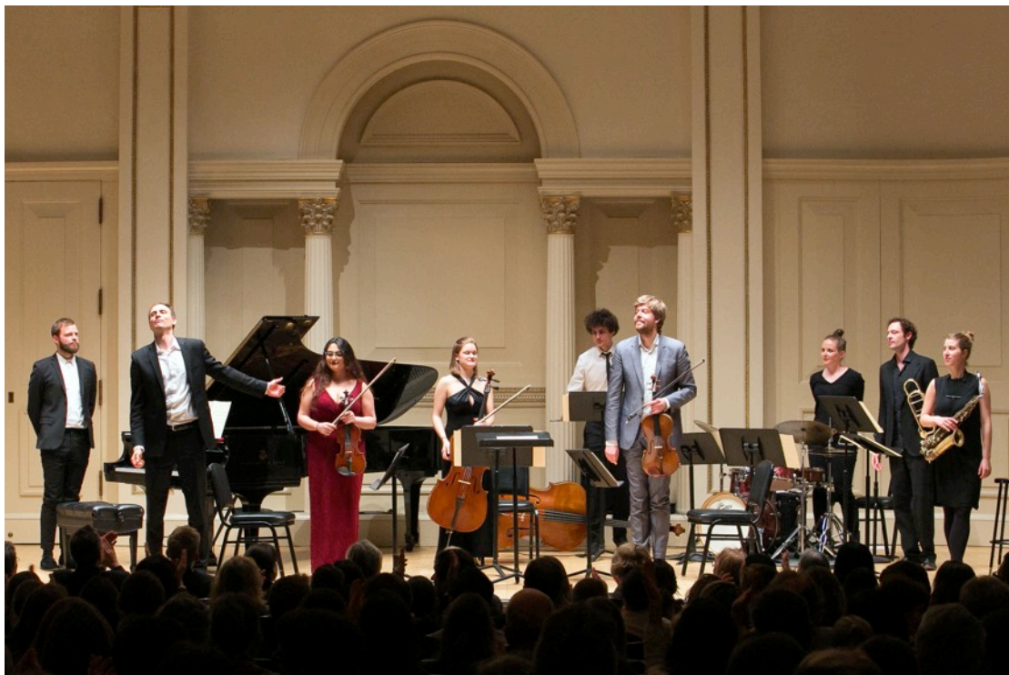
Sound Understanding Concert, Orchestra.