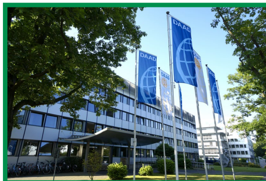
DAAD Headquarters Bonn, Germany

Deutscher Akademischer Austauschdienst German Academic Exchange Service