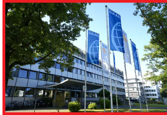
DAAD Headquarters Bonn, Germany

DAAD Deutscher Akademischer Austauschdienst German Academic Exchange Service