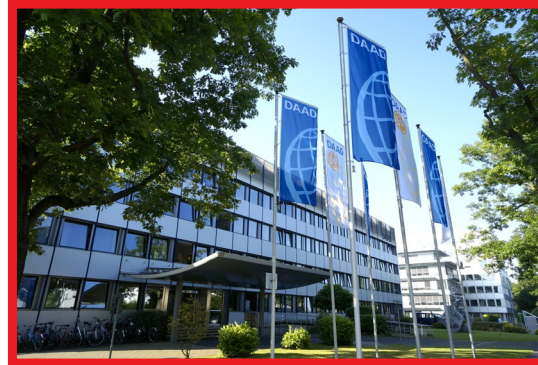
DAAD Headquarters Bonn, Germany

DAAD Deutscher Akademischer Austauschdienst German Academic Exchange Service