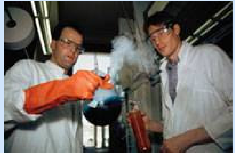
Interns by disciplines, 2009